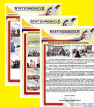
6 Stat Chronicles