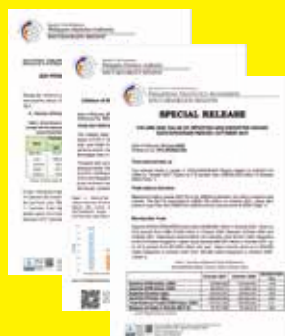
20 Special Releases