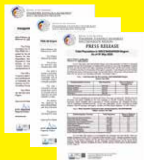
9 Press Releases