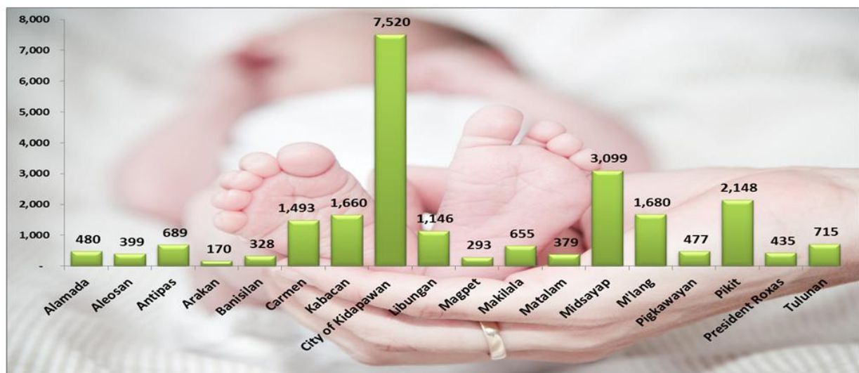
Figure 2. Number of Live Births by Place of Occurrence by City/Municipality

The Municipality of Arakan has the lowest recorded live birth in Province of Cotabato with 170 live births which is only 0.72 percent of the 23,766 total registered live births, then followed by the Municipality of Magpet with 293 (1.23%), and then by the Municipality of Banisilan with 328 (1.38%).