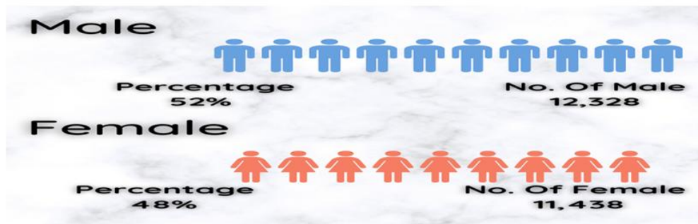
Figure 3. Number of Male and Female, Percentage, and Sex Ratio

As shown in figure 3, of the 23,766 registered live births in the Province of Cotabato in the year 2019, a total of 12,328 or 52 percent were males, while 11,438 or 48 percent were females. This depicts clearly that there were more male babies born than female babies in the Province of Cotabato with a sex ratio of 108 males for every 100 females.