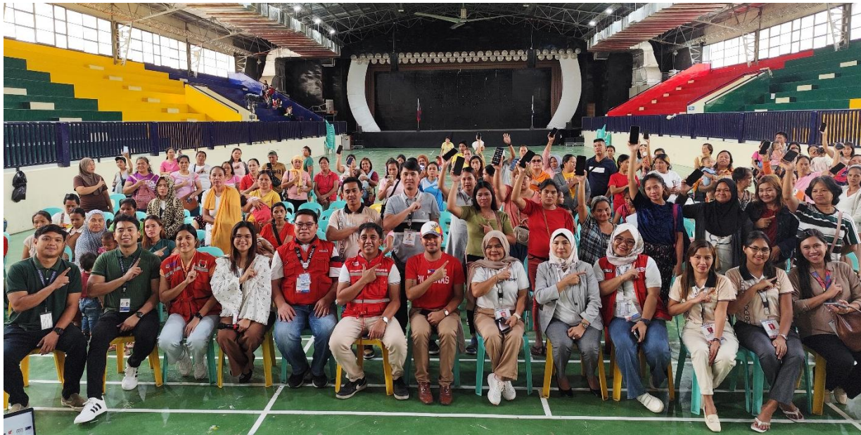
National ID personnel and Team Social Marketing Unit of DSWD with 50 Parent Leaders and 4Ps beneficiaries

The PSA remains dedicated to promoting transparency and efficiency through the National ID System. By engaging local communities, the agency continues to champion initiatives that protect citizens from misinformation while enhancing their access to essential services.