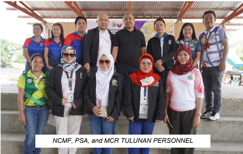
NCMF, PSA, and MCR TULUNAN PERSONNEL

Date of Release: May 16, 2025 Reference No. 47R12-PR-2025-37