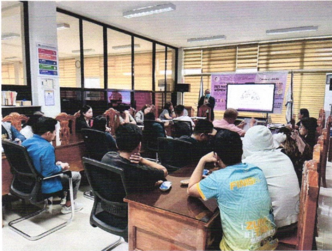
Participants were guided on how to register and avail of these benefits, ensuring access to quality healthcare for all.

This year's celebration of International Women's Day was a memorable and meaningful event, blending storytelling, camaraderie, and empowerment to honor the vital roles of women in building a brighter future.