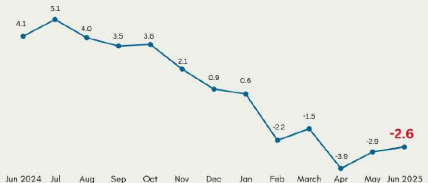
Headline inflation Rates in South Cotabato, All Items (2016=100) June 2024 - June 2025

The inflation rate of the bottom 30% income households of South Cotabato increased to -2.6 percent in June 2025 from -2.9 percent in May 2025.