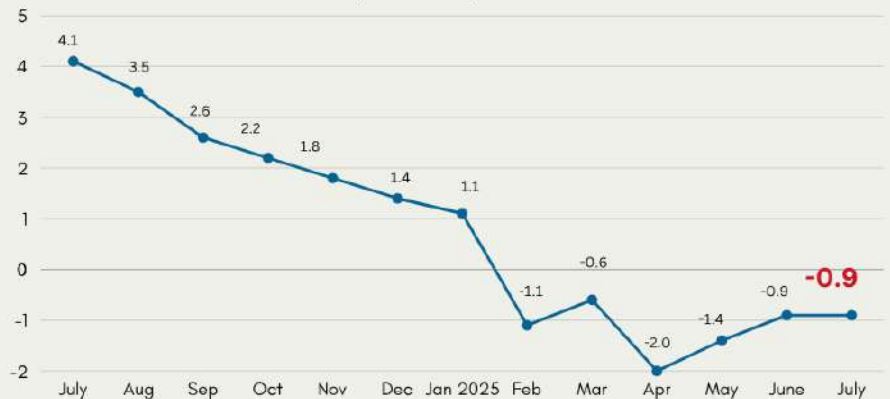
Monthly Headline inflation Rate in South Cotabato, All Items (2018=100) July 2024 - July 2025

The headline inflation or the annual rate of change on the prices of goods and services in the market basket of South Cotabato remained constant at -0.9 percent in July 2025.