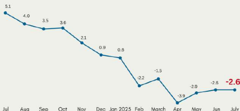
Headline inflation Rates in South Cotabato, All Items (2016=100) July 2024 - July 2025

The inflation rate of the bottom 30% income households of South Cotabato remained constant at -2.6% .