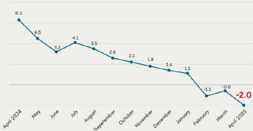
Monthly Headline inflation Rate in South Cotabato, All Items (2018=100) April 2024 - April 2025

The headline inflation or the annual rate of change on the prices of goods and services in the market basket of South Cotabato decreased to -2.0 percent in April 2025 from -0.6 percent in March 2025.