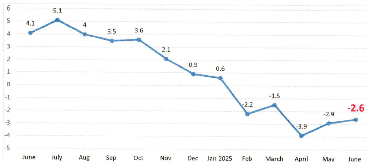
Figure 1. Headline Inflation Rates in South Cotabato, Bottom 30% Households June 2024 – June 2025 (2018=100)

Source: Retail Price Survey of Commodities for the Generation of Consumer Price Index, Philippine Statistics Authority