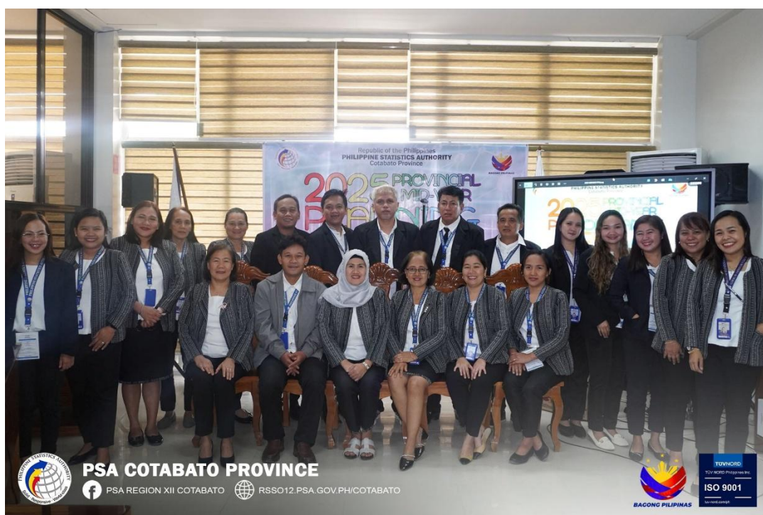
In photo are the employees of the PSA-Cotabato Province during the 2025 Provincial Mid-Year Performance Review on June 18-20, 2025.

18 to 20 June 2025 – The Philippine Statistics Authority (PSA) – Cotabato Province successfully conducted its three-day 2025 Provincial Mid-Year Performance Review at Hridaya Resort, Brgy. Luvimin, Kidapawan City, Cotabato, with the theme “Building a Resilient, Agile, and Future-Fit PSA.” The activity served as a platform to assess accomplishments, reflect on challenges, and realign strategies for the remaining half of the year.