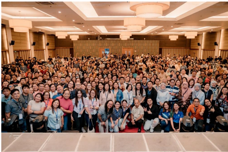
In photo are the participants of the two-day Linang Conference on May 15-16, 2025 at the EMR Convention Center, Koronadal City.

The participants actively engaged in a lively technical session, panel discussions, and interactive activities designed to equip government agencies with the tools to implement the new procurement guidelines effectively. The sessions aimed to enhance financial planning and management in government agencies while ensuring compliance with existing procurement laws and standards.